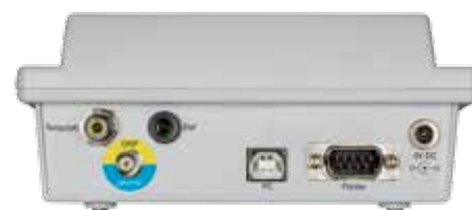
Back panel pH 60 DHS