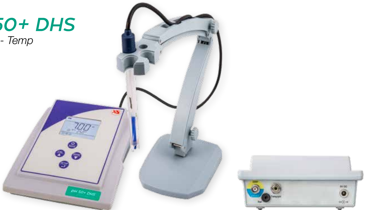
Back panel pH 50+ DHS

An elegant and ergonomic container encloses the best of electronics.