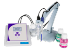
PC 62 DHS