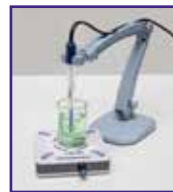
ST 10 stirrer