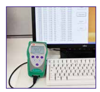
PC connection with USB cable