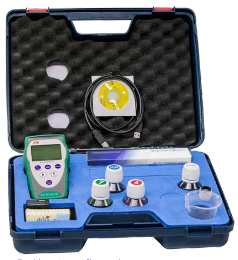
Complete carrying case with accessories, useful for use as a portable laboratory