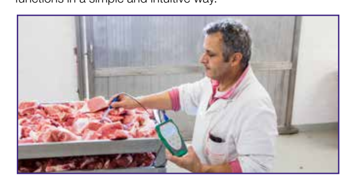
pH 70+ DHS FOOD

All the functional parameters of the sensor connected during the measurements, or during the calibration, are constantly monitored and, in case of errors, reported to the operator. Only 4 keys (6 keys for pH 70+ DHS) allows to manage all functions in a simple and intuitive way.