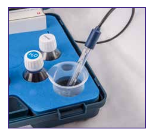
Sample housed in the suitcase to avoid accidental overturning