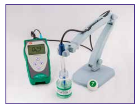
Support for desk use (optional)