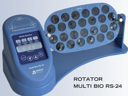
ROTATOR MULTI BIO RS-24

Platform PRSC-22 for tubes 22 x 15 ml (Tube Diam 10-16 mm)