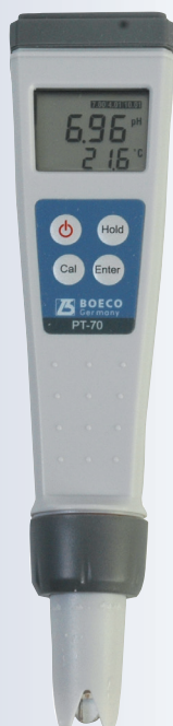
PH/TEMP. TESTER PT-70 WITH REPLACEABLE ELECTRODE