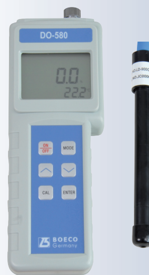
BOECO PORTABLE DO/TEMP METER MODEL DO-580