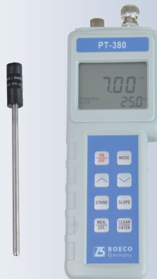
BOECO PORTABLE PH/ ORP/TEMP METER MODEL PT-380