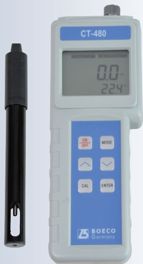
BOECO PORTABLE CONDUCTIVITY/ TDS/SALINITY/TEMP METER MODEL CT-480