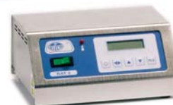
System programmer for temperature/time RAT-2. Part No. 4001538